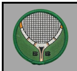
BB 1013 Lawn Tennis d 65mm 1968 - 1994