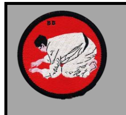
BB 1011 Karate d 65mm 1984 - 1994