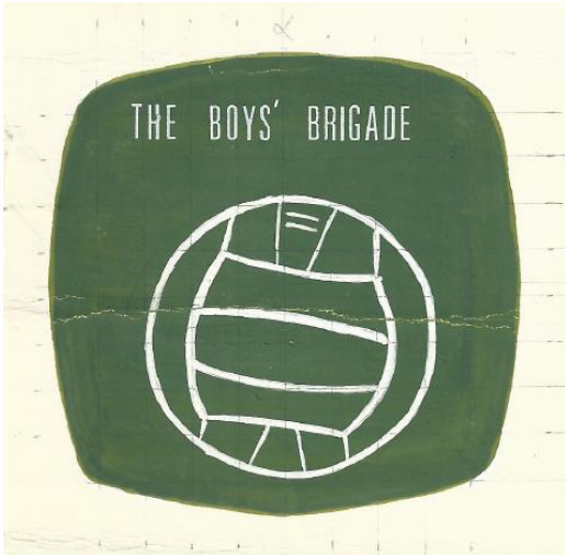
1967 artwork for the Football colour

For many years, certain types of sport, athletics and physical activity generally, had been included in badge awards: others, such as football, had been omitted. The Company Section Activities sub-committee minutes from 22 nd July 1967 record: "a system of "colours" was approved. The Supplies Department were be asked to produce suitable cloth colours for a specified list of sports and games, with an additional blank one, on which the name of the sport or game 'could be inscribed locally. It was also agreed that not more than one colour for each sport or game should be awarded in each session, and that the Sportsman's Badge and subsequent stages would be awarded when three separate colours in the same or different activities had been gained."