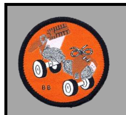
BB 1015 Roller Skating d 65mm 1984 - 1994