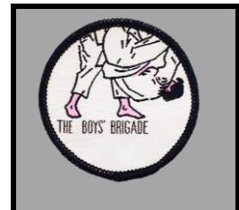
BB 1012 Judo d 65mm 1968 - 1994