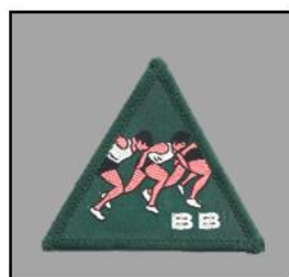
BB 1004 Cross-Country h 65mm x w 55mm 1968 - 1994