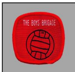
BB 1007 Football h 63mm x w 63mm 1968 - 1994