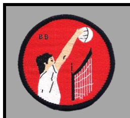
BB 1021 Volleyball d 65mm 1984 - 1994