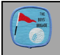
BB 1009 Golf h 63mm x w 63mm 1968 - 1994