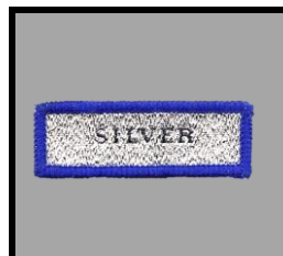
BB 1022 Silver h 60m x w 20mm 1984 - 1994