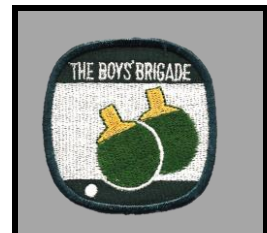
BB 1020 Table Tennis h 63mm x w 63mm 1968 - 1994