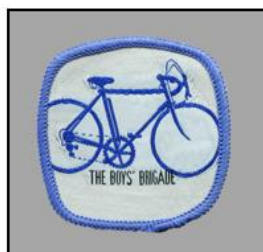
BB 1005 Cycling h 63mm x w 63mm 1968 - 1994