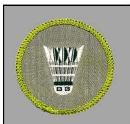
BB 1002 Badminton d 65mm 1968 - 1994