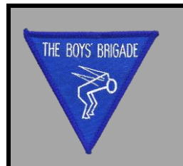
BB 1019 Swimming h 65mm x w 55mm 1971 - 1994