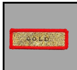
BB 1023 Gold h 60m x w 20mm 1984 - 1994