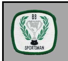
BB 1018 Sportsmans h 63mm x w 63mm 1968 - 1994