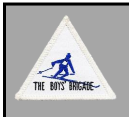
BB 1017 Ski-ing h 65mm x w 55mm 1968 - 1994