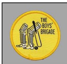
BB 1003 Cricket d 65mm 1968 - 1994