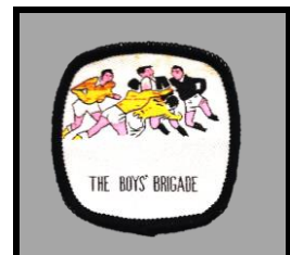
BB 1016 Rugby h 63mm x w 63mm 1968 - 1994