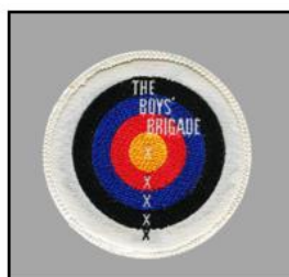
BB 1001 Archery d 65mm 1968 - 1994