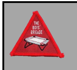
BB 1010 Gymnastics h 65mm x w 55mm 1968 - 1994