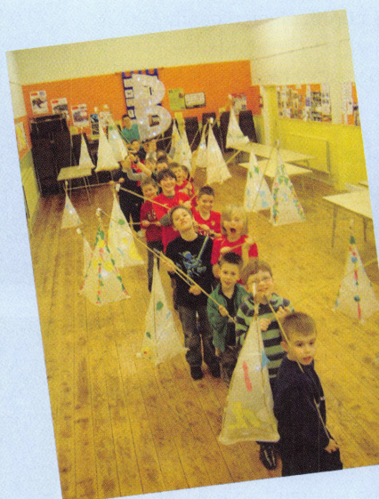
Boys leading the procession with their lanterns

125 boys celebrated 125 years of The Boys' Brigade on the 250th birthday of Robert Burns. Members of Solway Battalion were out in force with the crowd of 17,000 in Dumfries. Boys and leaders made lanterns, then led one of the four huge lantern processions through the town. As darkness fell, the lanterns were lit, and everyone enjoyed great music from the big stage and screen before the lone piper played on Devorgilla Bridge, and the Tam O'Shanter fire sculpture was spectacularly lit.