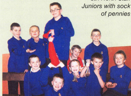
8th North Staff Juniors with sock of pennies

8th North Staffs Junior Section supported the Palm in Palm Project to help The Boys' Brigade in Cameroon by encouraging family and friends to fill an old, red walking sock with pennies (and other small change). However, as woolly socks do, the more that was put in the more the sock stretched. Over £80 has been collected so far and the Section hopes to reach £125 in recognition of the 125 Celebration.