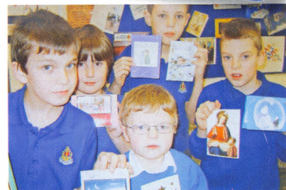
Juniors made 125 Christmas cards and distributed them locally.