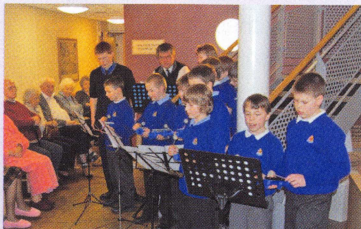
Junior Section performing at local residential home

The company will soon be setting up an 125 exhibition in Dunblane Cathedral Museum, when it reopens following an extensive lottery-funded refurbishment.