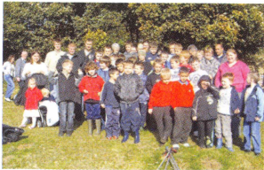
Members of 11th Leeds earning their Community Award at 'Hill Top'

During a weekend last October the members of 11th Leeds joined volunteers of the Armley Common Right Trust to restore a piece of land called "Hill Top" in Armley. Boys, parents and officers collected rubbish and the Juniors planted 125 daffodil bulbs in formation to spell "Boys' Brigade". Company Section and Seniors cleared overgrown bushes and trees and placed a restored bench, complete with plaque. They look forward to visiting the site in the spring to see the bulbs in bloom.