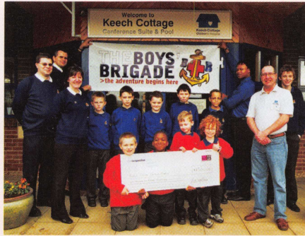
Pictured are representatives of 20th and 23rd Luton Companies who visited the Hospice to hand over the cheque.