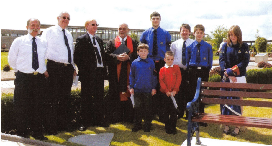
The witnesses from all sections of the Brigade assemble in the garden

O n Sunday 5th July six special Brigade 'witnesses' assembled at the BB Memorial Garden along with a Minister and many other BB members and friends, for a brief ceremony to deposit a '125 Time Capsule' for fifty years in a prepared chamber.