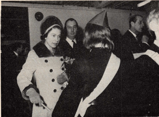
Her Majesty and the drummer.