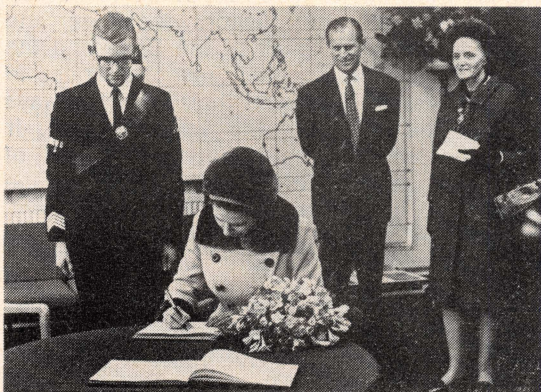
Signing the Visitors' Book.