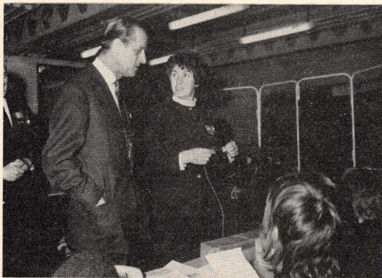
Prince Philip with Junior Section Boys.