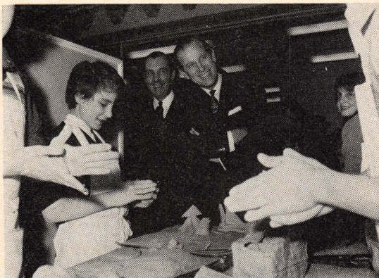
The Prince and the clay modellers.