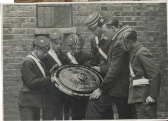
2nd Swindon in 1978 at their 25th Anniversary