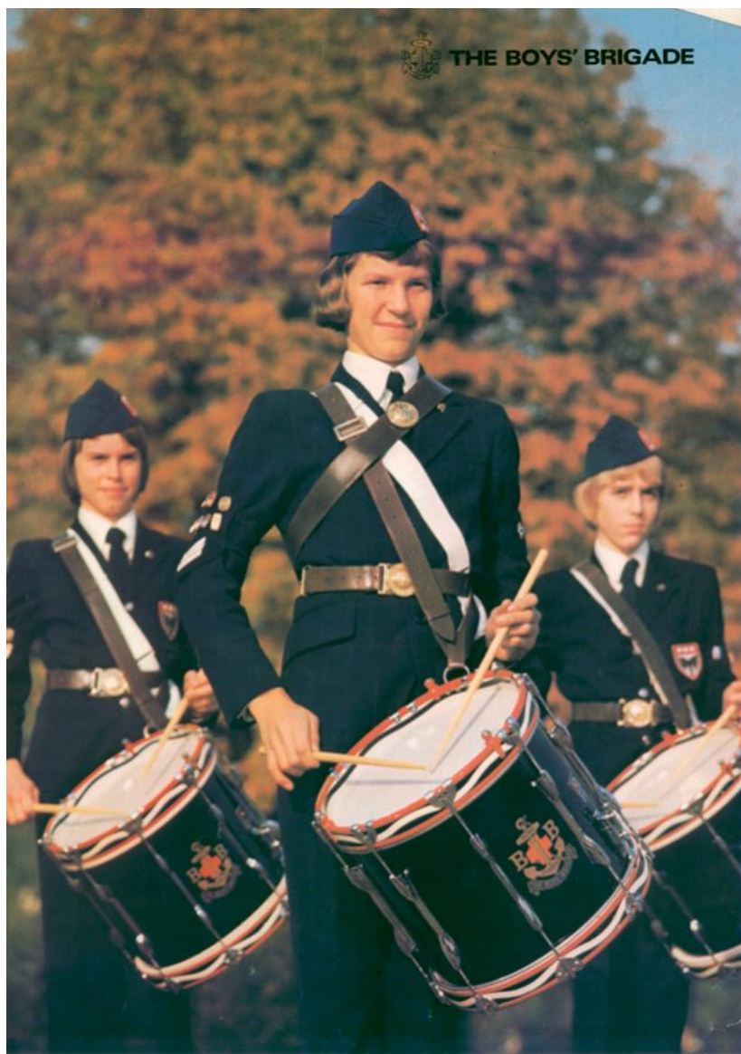
1970's A2 Colour Poster