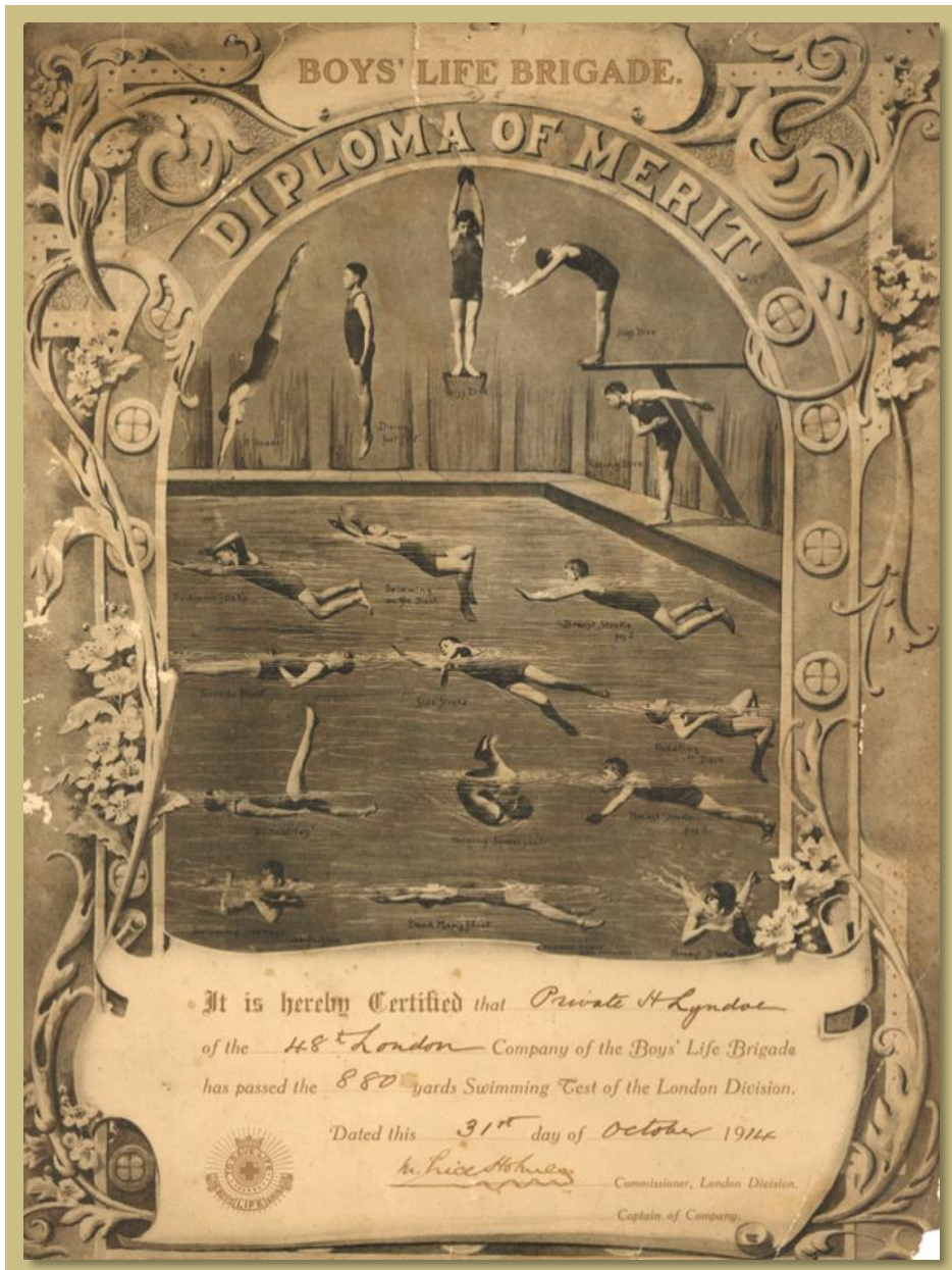
Boys' Life Brigade Swimming diploma of merit