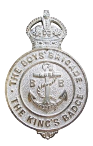
The original 1913 Kings badge

We are continually looking to add to our stock of BB items for the online shop. Many Companies and Battalions have new 'old' stocks of badges, uniform, publications and memorabilia, in storage and cupboards which is no longer of use. Please consider donating them to us, so that we can continue to preserve the heritage of The Boys' Brigade